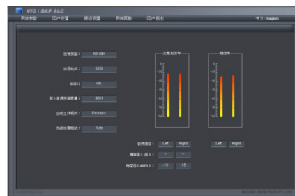
Web server monitoring the status of video and audio signal, the audio PPM before and after loudness control